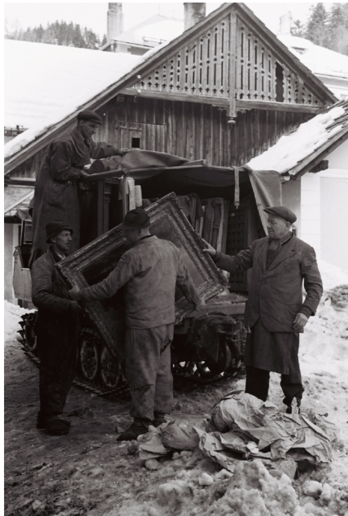
Art transportations, Salt Mine Altaussee, 1943/44