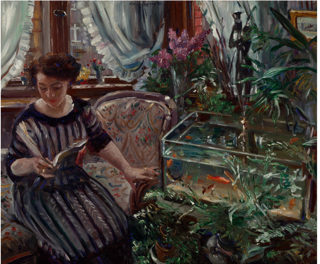
Lovis Corinth, Dame am Goldfischbassin, 1911