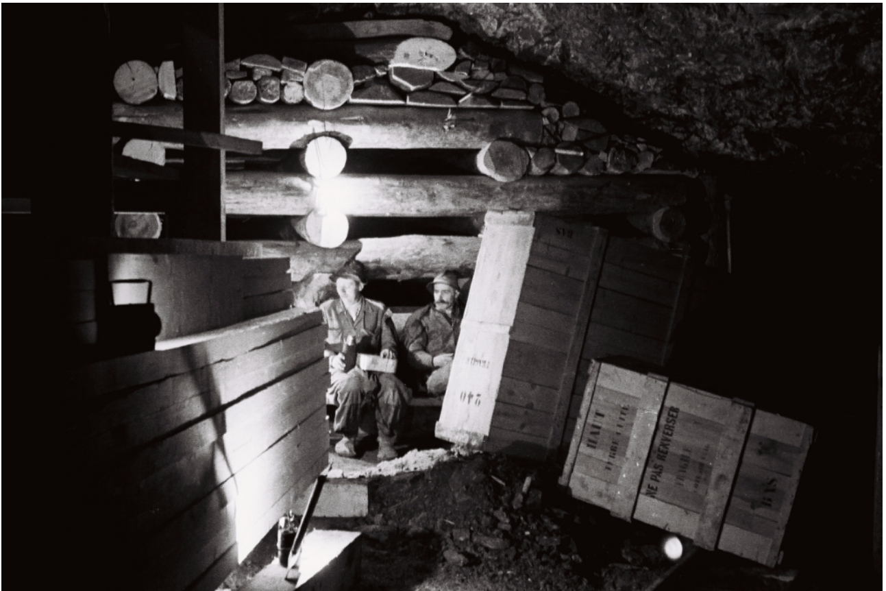
Art transportations, Salt Mine Altaussee, 1943/44