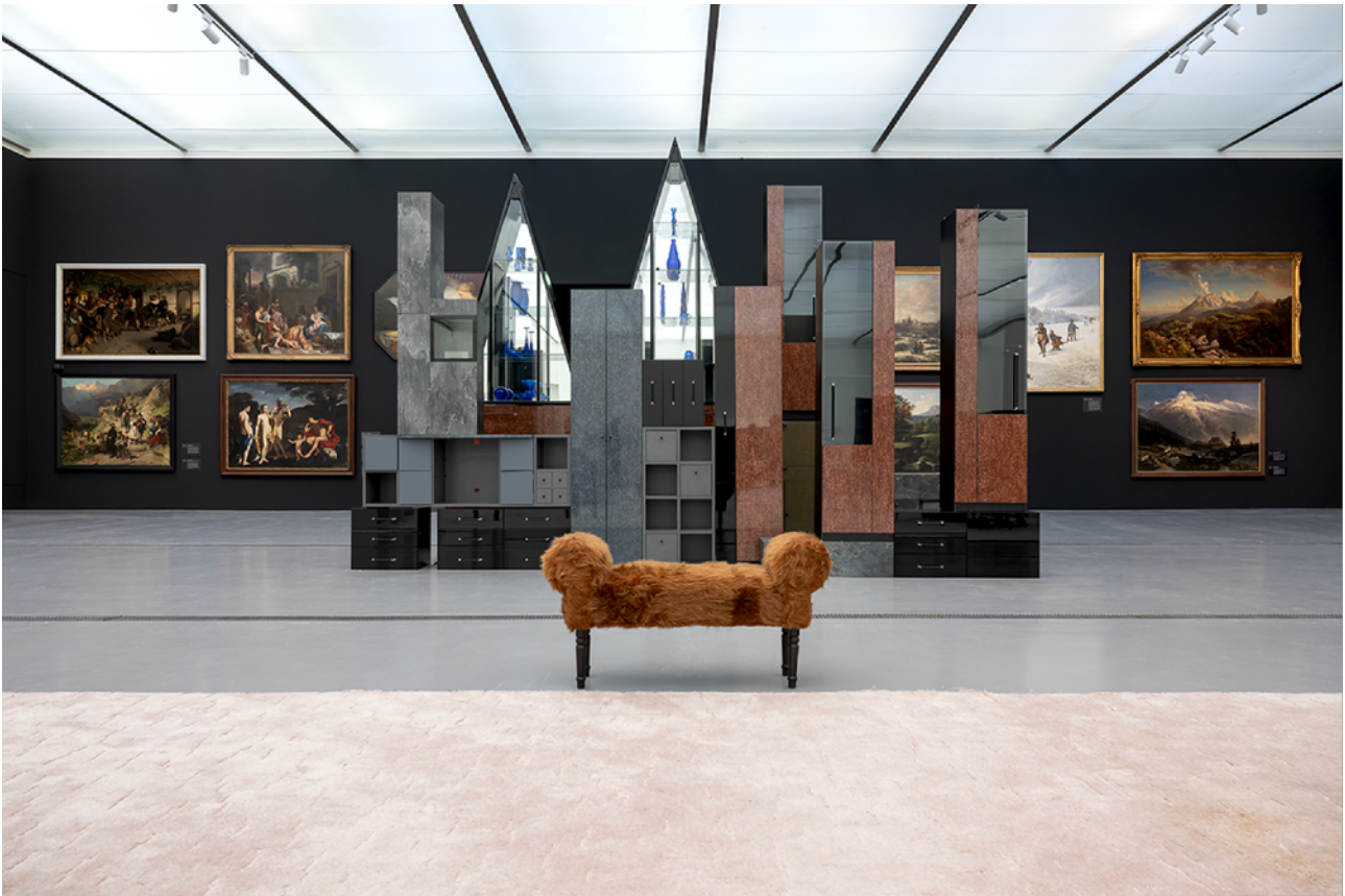
Exhibition view "The Journey of the Paintings", 2024 Lentos Kunstmuseum Linz